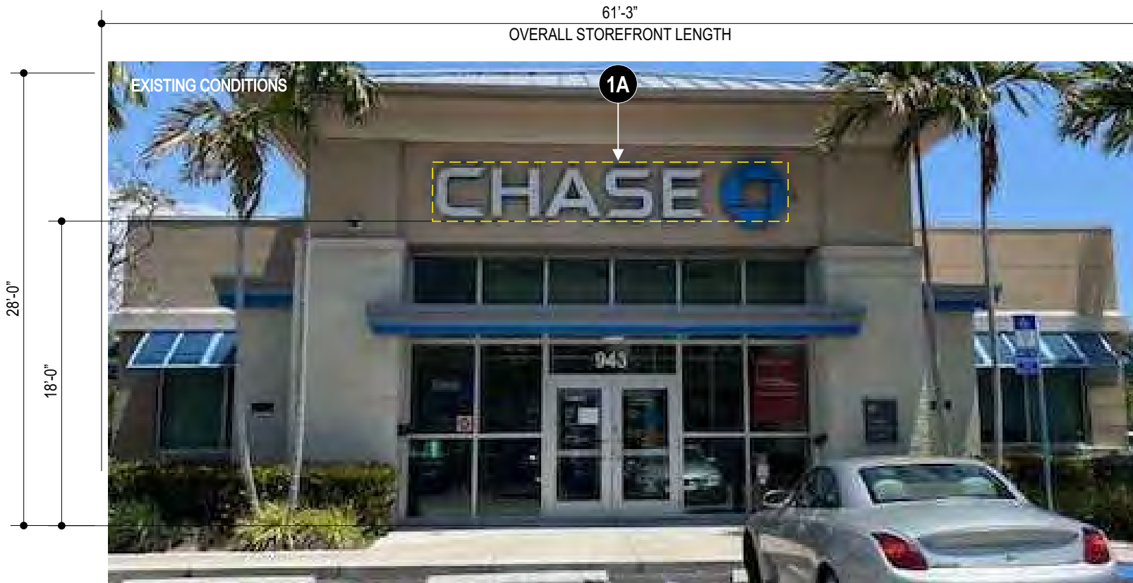
1A SOUTH EXTERIOR ELEVATION SCALE: 1/8" = 1'-0"